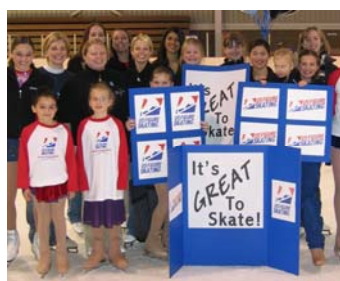
Young skaters are excited for the start of National Skating Month.